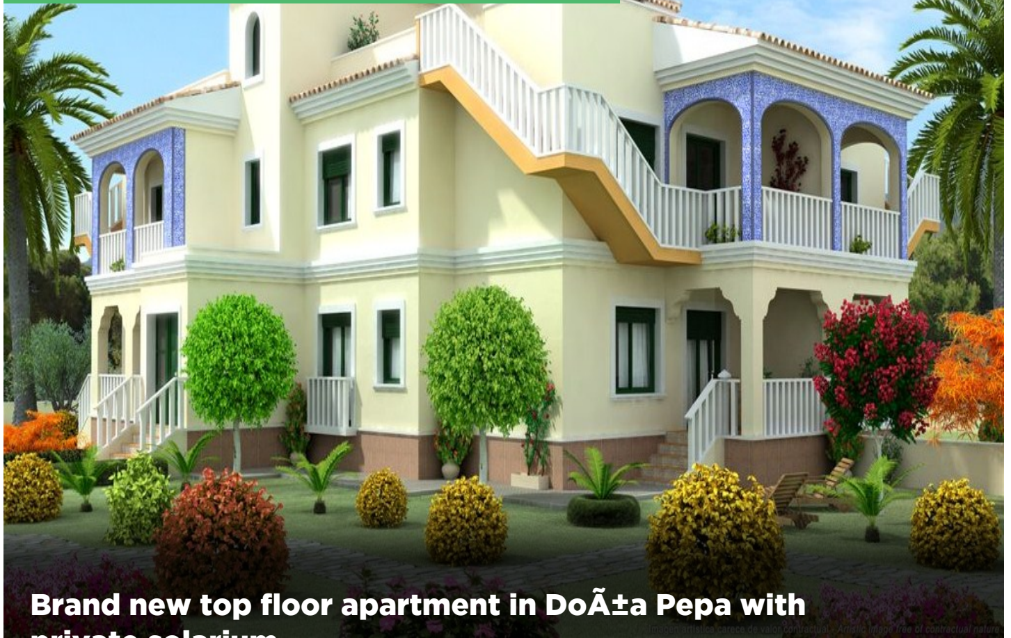
Brand new top floor apartment in Doña Pepa with private solarium