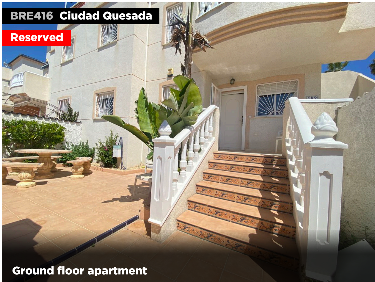
Ground floor apartment