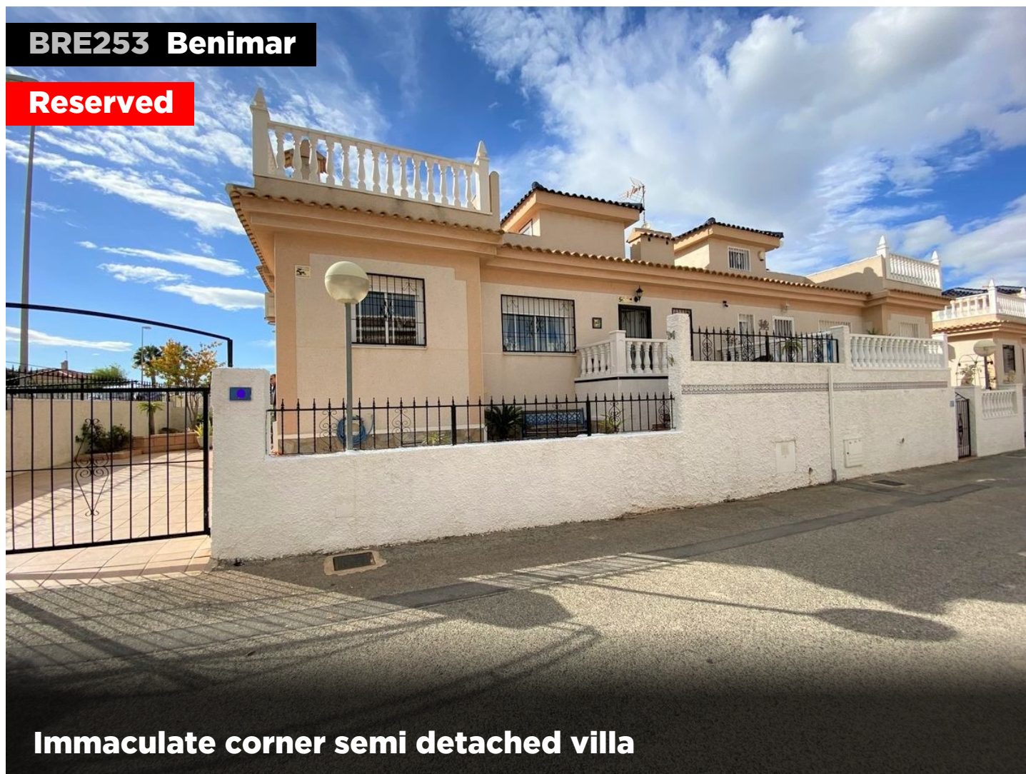
Immaculate corner semi detached villa